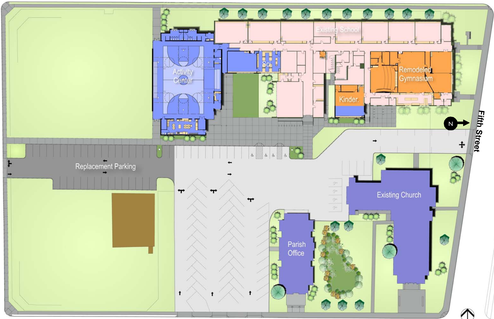
Phase 1 Site Plan