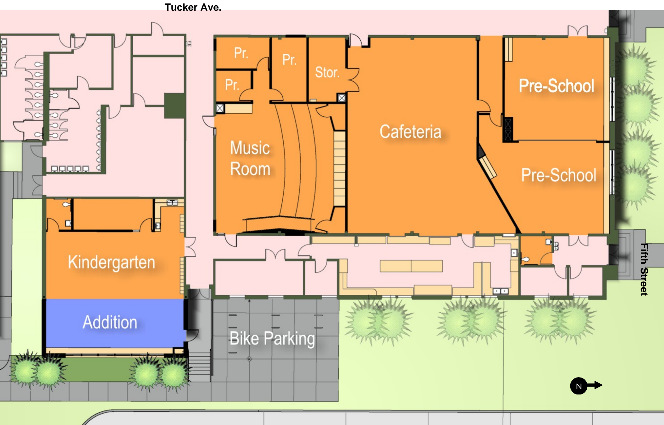
PHASE I: Remodel of old gym and stage to a Music Room, Cafeteria/Meeting room and Preschool Kindergarten Expansion